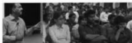
Very often in the realm of business, one wonders which kind of aptitude is more relevant. While 'business sense', which deals with business decisions with a touch of technique,

may seem to be the obvious candidate for many, the common sense approach has its own advantages (After all the common sense is the mother of all "senses"). This common